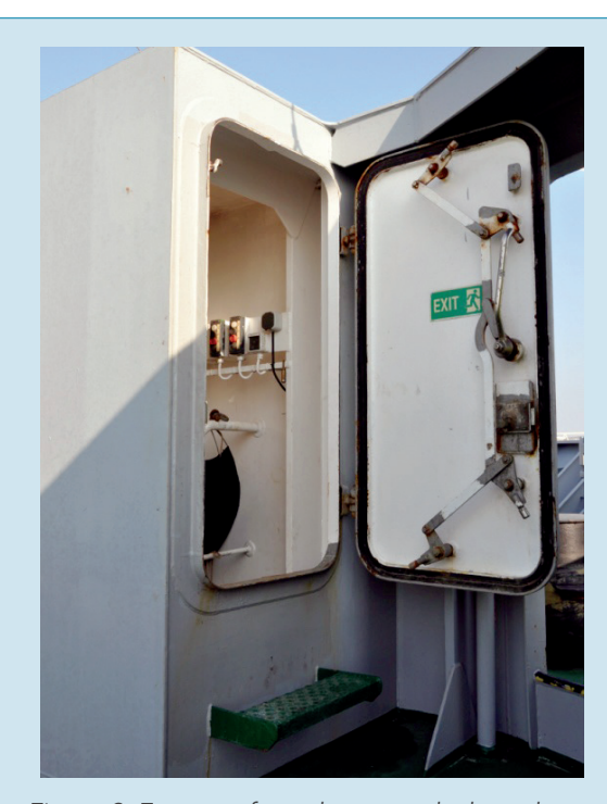
Figure 2: Entrance from the outer deck on the forecastle to the stairwell leading to the hold.

The second mate already suspected what had happened, locked the door and attempted to call the captain. However, in the panic of the moment the second mate called the captain's cabin instead of the bridge and therefore was unable to reach the captain. The second mate then rushed back to the bridge to inform the captain, meanwhile warning the seaman working at the fore of the ship. The crew made an attempt to rescue the first mate. Two crew members, equipped with breathing apparatus tied a rope around the first mate's waist. Two men, who were located at the top of the stairwell, subsequently pulled the rope and then lifted the first mate out of the stairwell with the assistance of two crew members equipped with breathing apparatus. The rescue attempt was compounded by the fact that the stairwell was in an awkward position and the first mate's strong build. Once on deck the first mate was unsuccessfully resuscitated. The first mate had died. The forensic pathologist in the port established asphyxiation as the cause of death.