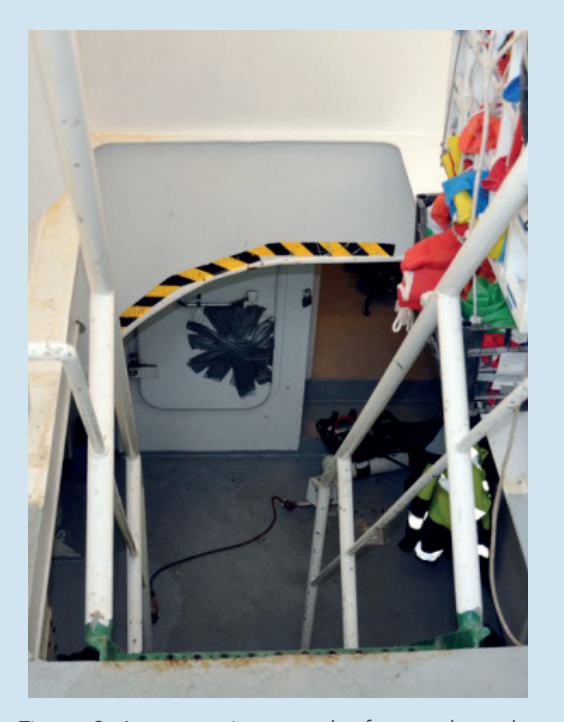
Figure 3: Access stairway to the forecastle and access door to the stairwell leading to the hold.