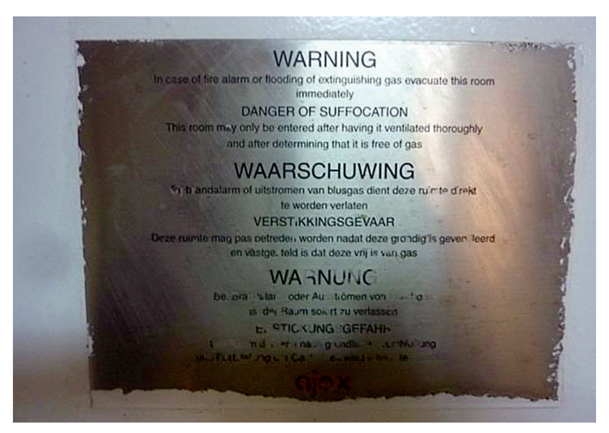
Figure 4: Warning on the access doors to the stairwell.